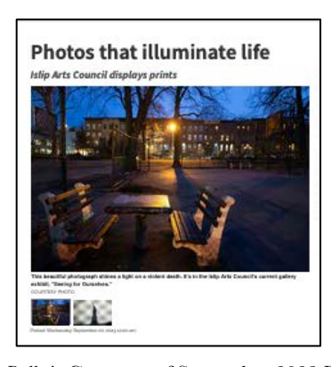
Islip Bulletin Coverage of September 2023 Exhibit Staged by Islip Arts Center in Bay Shore, NY